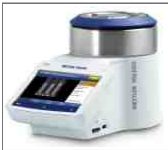
Melting/Boiling Point Apparatus