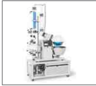
Industrial Rotary Evaporator