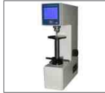
Digital Hardness Tester