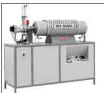
Vacuum Tube Furnaces