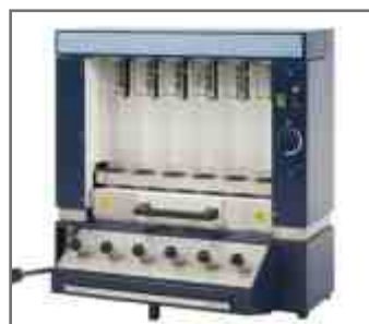
Fibre Extraction System