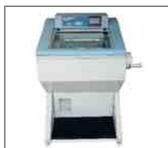
Tissue Culture Cabinet