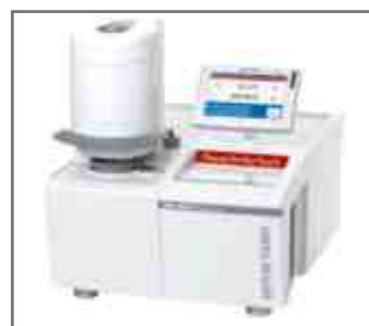
TMA (Thermomechanical Analysis)