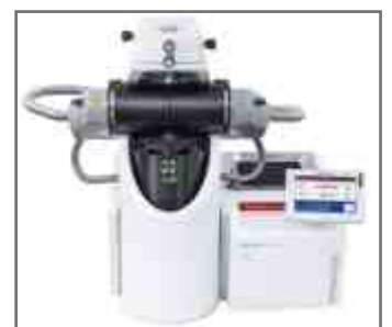
DMA (Dynamic Mechanical Analyzer)