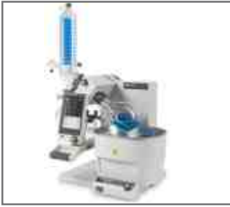
Laboratory Rotary Evaporator