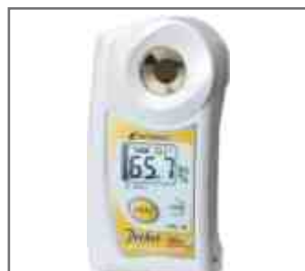
Portable Refractometer Brix-Acidity/Salt Meter