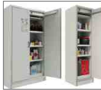
Reagent Storage Cabinet