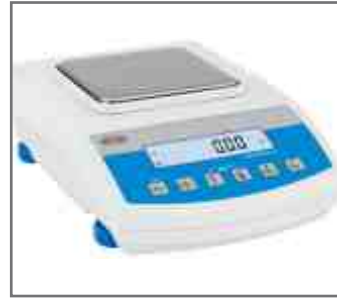
Top Loading Balances