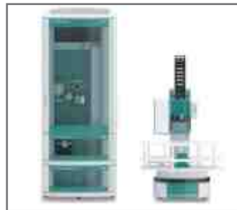
Ion Chromatography System