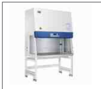
Microbial Safety Cabinet