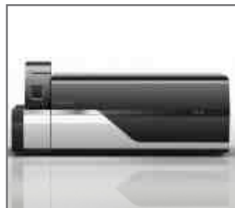
Mass Spectrometry (Single/Triple Quad/Q-TOF)