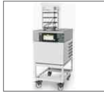
Laboratory Freeze Dryer