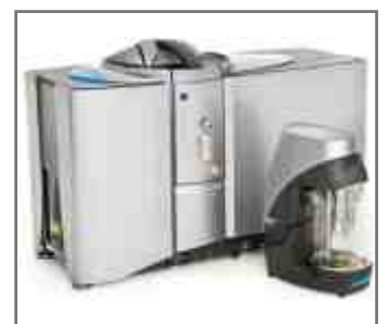
Particle Size Analyzers