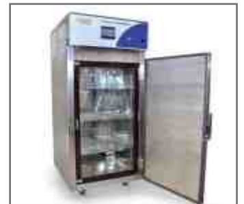
Photo Stability Chamber