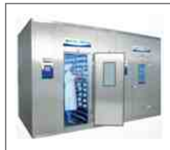
Walk in Stability Chamber