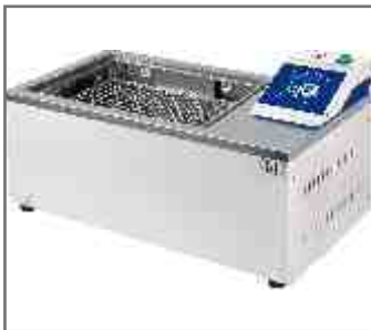
Water Bath Shaker