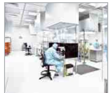
Clean Room Services