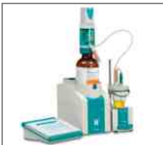
Karl Fischer Titrator