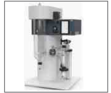
Laboratory Spray Dryer