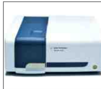
UV-Vis Spectroscopy (Single/Double beam)