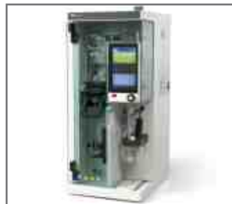
Kjeldahl System (Digestion-Distillation-Scrubbing & Titration System)