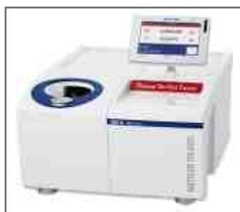
DSC (Differential Scanning Calorimetry)