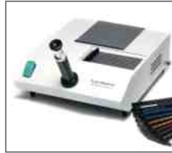
Tintometer Measurement Tintometer