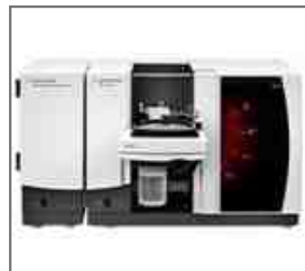
Atomic Absorption Spectroscopy