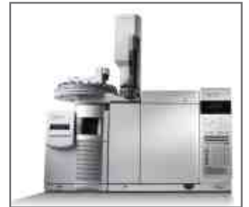
GAS Chromatography (GC/GC-MS/GC-MS-MS)