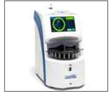
Osmometer for Osmolality measurement