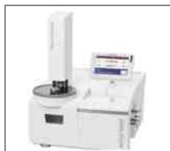
TGA (Thermogravimetric Analyzer)