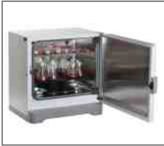
Orbital Shakers CO2 Incubatorz