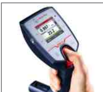
Portable Density Meter