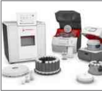
Microwave Digestion System