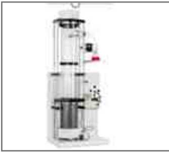
Nano Spray Dryer