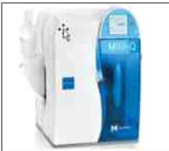
Lab Water Solutions