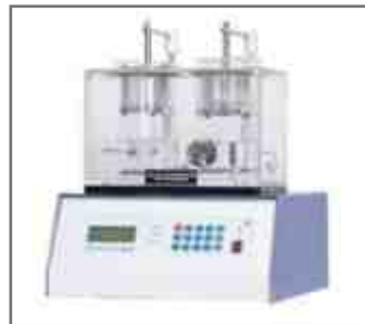
Disintegration Test Apparatus