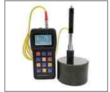
Portable Hardness Tester