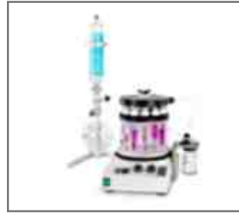
Parallel Evaporation System