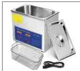
Digital Ultrasonic Bath